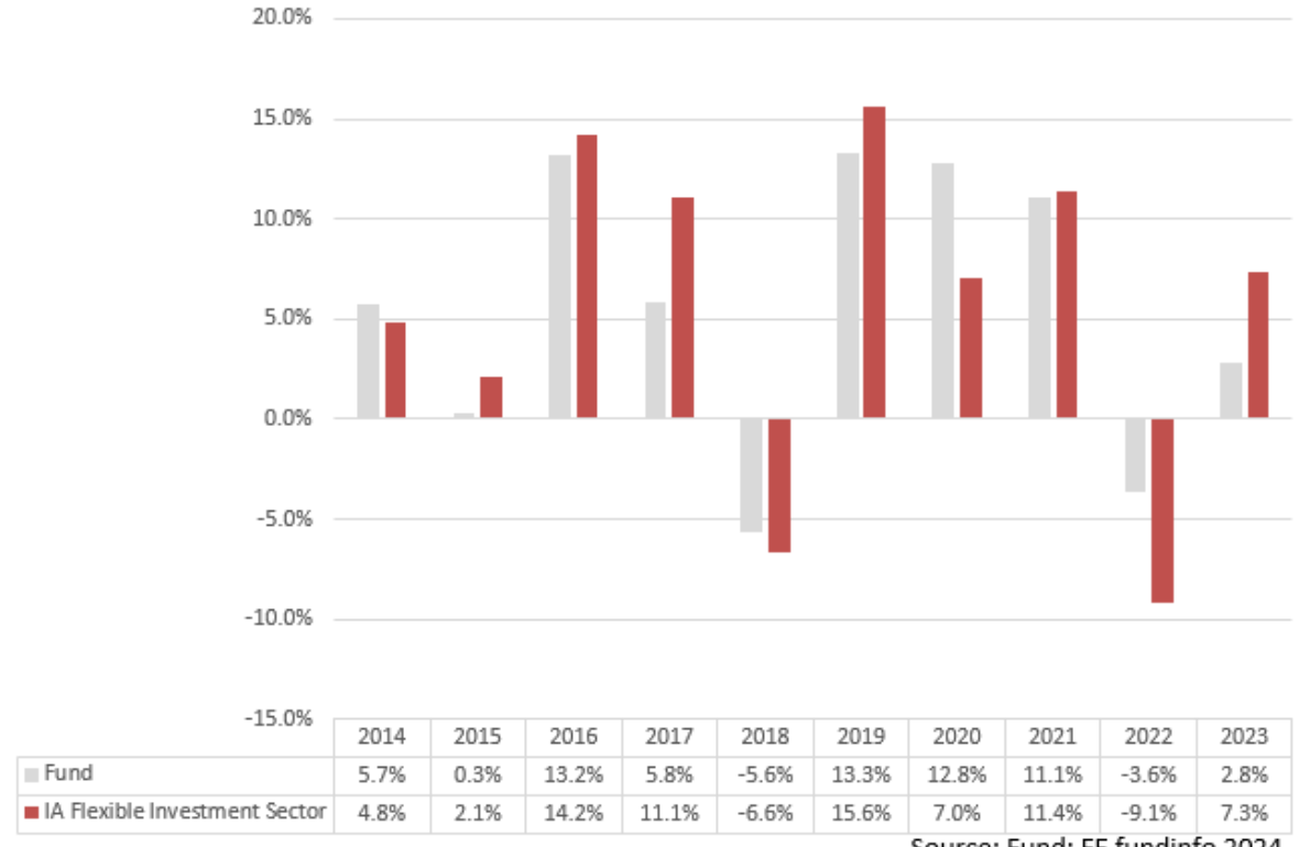
Appendix 3 Historical Performance Data